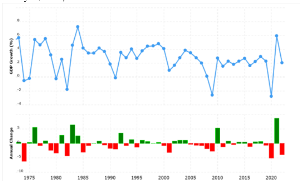
Figure 1 GDP Growth in USA (1973 – 2022)

The United States of America leads all other nations in terms of imports of products and services, making it a highly desirable destination for foreign investors (Mosteanu, 2019). Thus, there are two more reasons why factors influencing the growth of the US GDP are a fascinating area of study. First off, compared to most other nations, the United States has allowed foreign investment for a longer period. As a result, it offers lengthier time series data for analyzing the growth effects of FDI than most other nations do. Furthermore, the U.S. has been running huge and growing current account deficits that have been financed by equally large investment inflows. Whether the growing U.S. trade deficit is sustainable hinges, in part, on whether investment inflows enhance U.S. productivity. This is the reason why it the important to institute a study about the factors affecting Gross Domestic Product (GDP) Growth (Kim & Loayza, 2019).